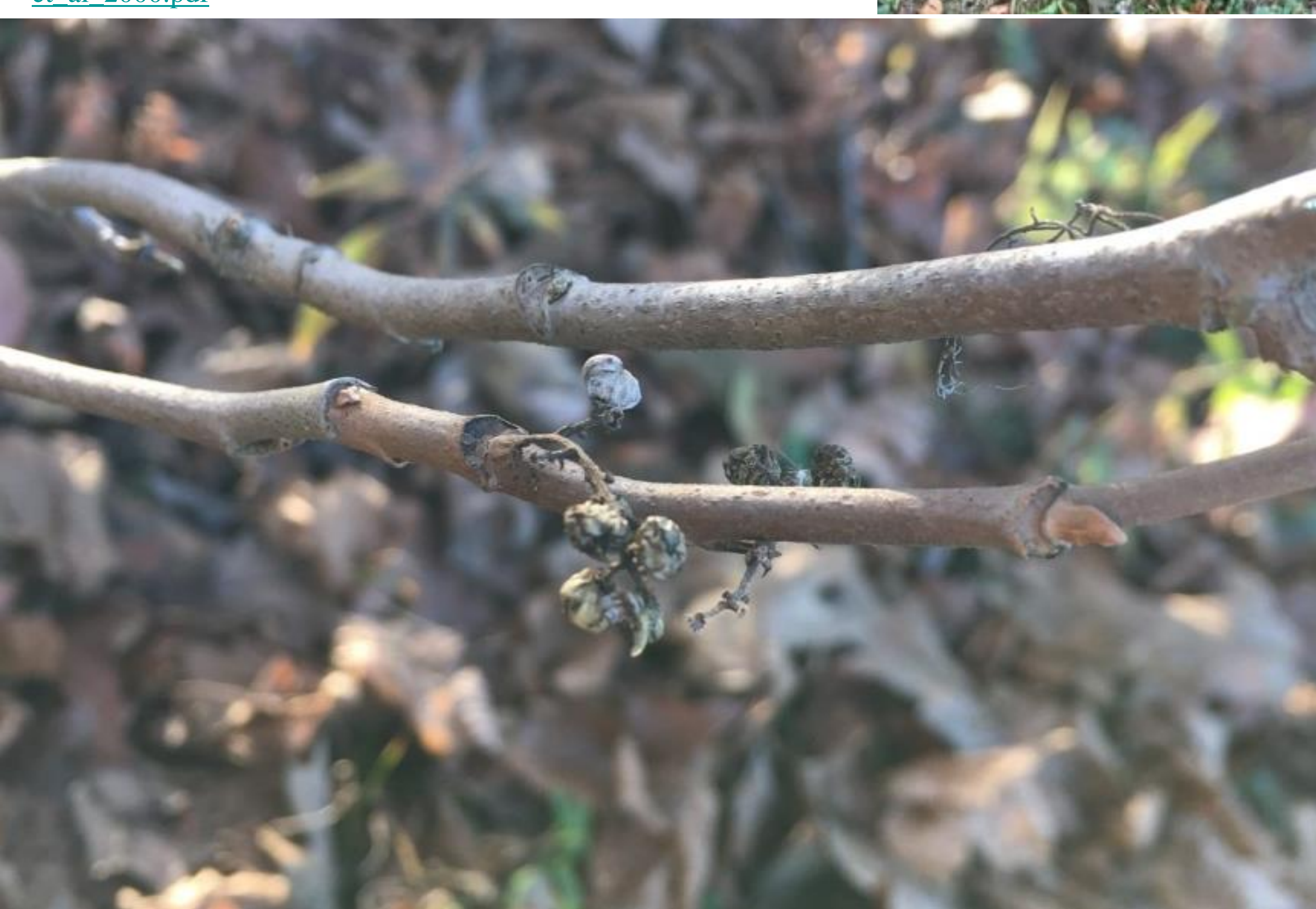
Poison Ivy drupe and plant pictures taken in Latrobe, Pennsylvania, October 2020.